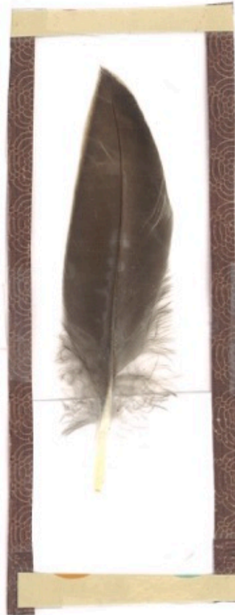
DUCK FEATHER BOOKMARK

NUMBER 4: So we are giving out bookmarks. At Nielsen Grove Park there were thousands of duck feathers all the way around it. So we picked some up, lots of them, and put them in a Ziploc Bag. And we put them in the laminator with this little paper on the back that tells what they can eat and what they can't. And I've been passing them out.