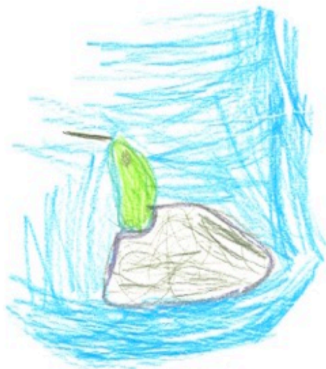
Male Mallard Duck