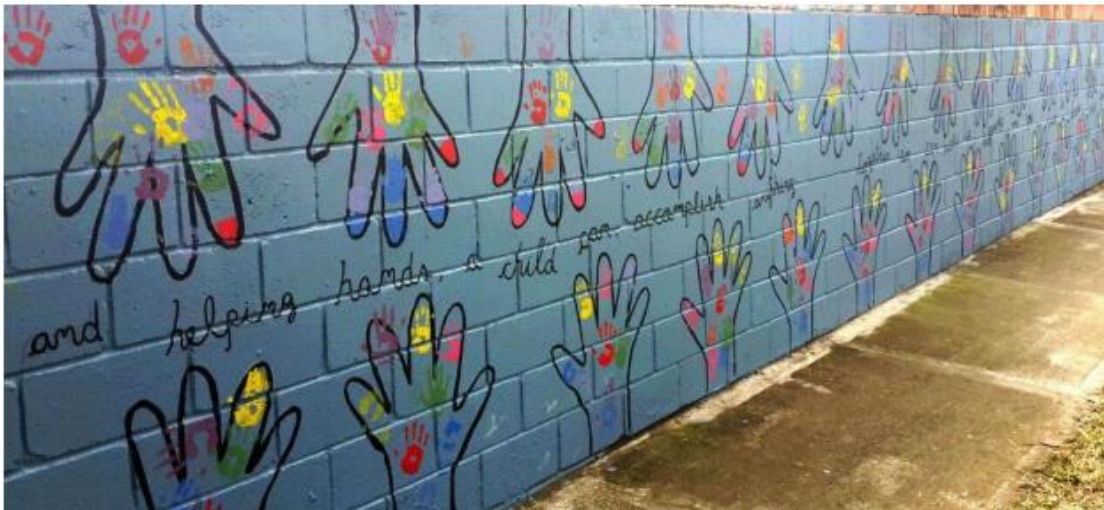
Example from Roots & Shoots Medellín, Colombia

Step 5: Enjoy your masterpiece and share it!