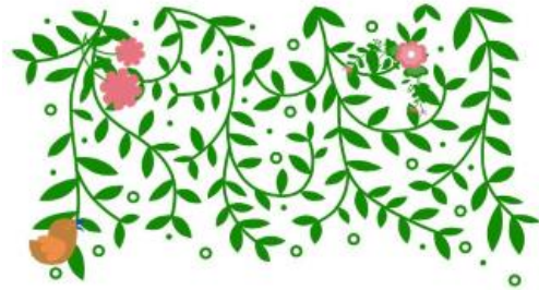
Make your own ivy

Step 3: Divide into smaller groups. Each group will paint a part of the whole.